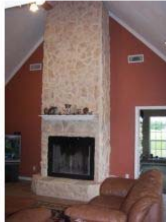
LIVING RM WITH FIREPLACE