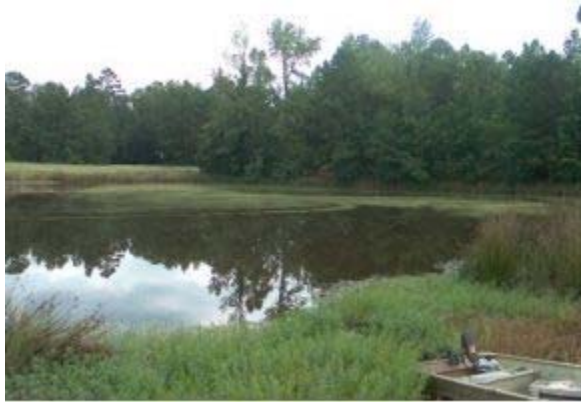
3 ACRE LAKE AND POND TO BOOT