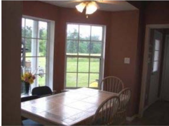
COMBO DINING ROOM