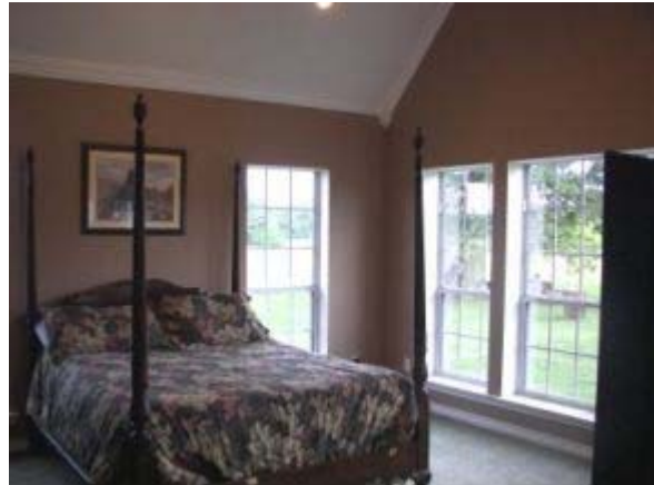
MASTER BEDROOM SUITE WITH VIEW

--- Information herein deemed reliable but not guaranteed --- 07/28/2009 04:43 PM