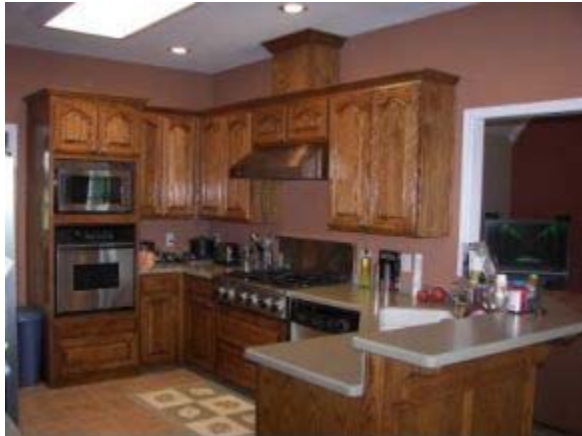
HEAVY DUTY APPLIANCES