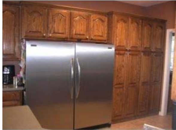
LOVE YOUR SIDE BY SIDE FRIDGE