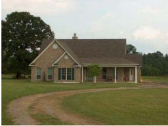
HOME WITH 3 AC LAKE ON 41 AC