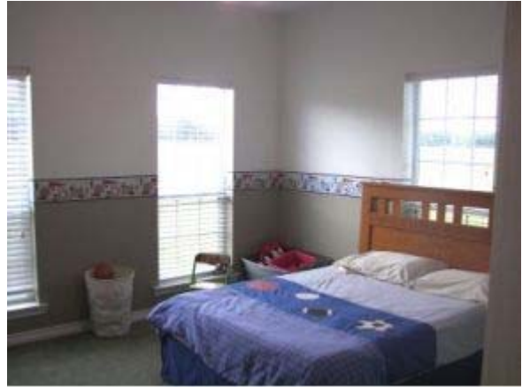
3 BEDROOMS AND 2.5 BATHS