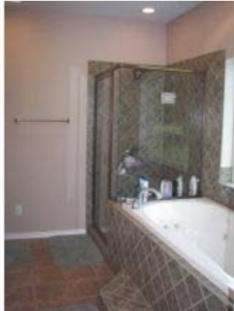
WHIRLPOOL AND SEPARATE SHOWER